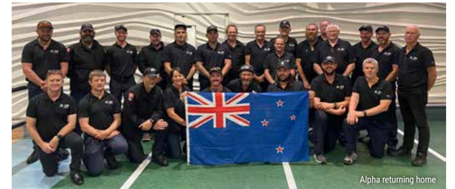
Alpha returning home

Our crews provided support to the communities in the path of fires which included securing the active fire edge, mopping up, digging out hotspots, cutting fallen branches, clearing access tracks and escape routes, making helipads and all other jobs as necessary.