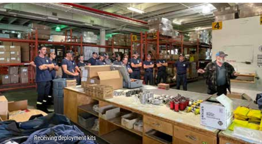
Receiving deployment kits