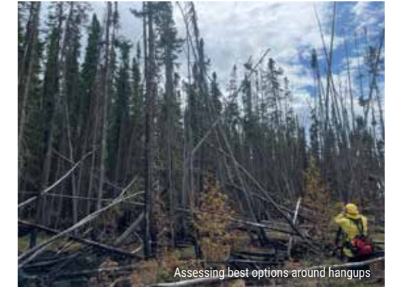
Assessing best options around hangups

Alberta is around three times the size of Aotearoa and hot, dry conditions throughout the province are helping to fuel the well over one million hectares of active fires currently burning in the province.