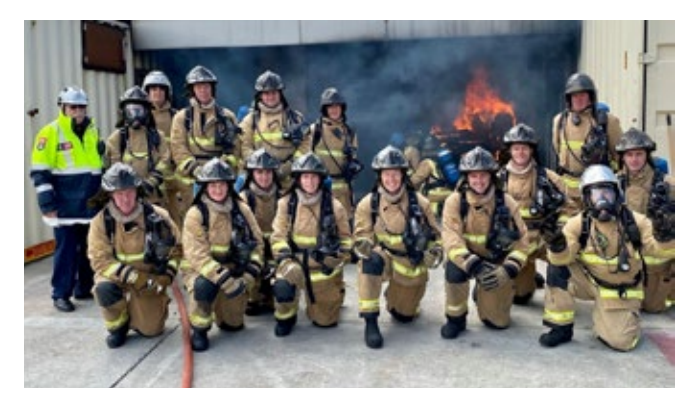
Congratulations to the latest group of volunteer firefighters who just completed their recruit course. They were the first group to use our new Live Fire Training Facility at Woolston.